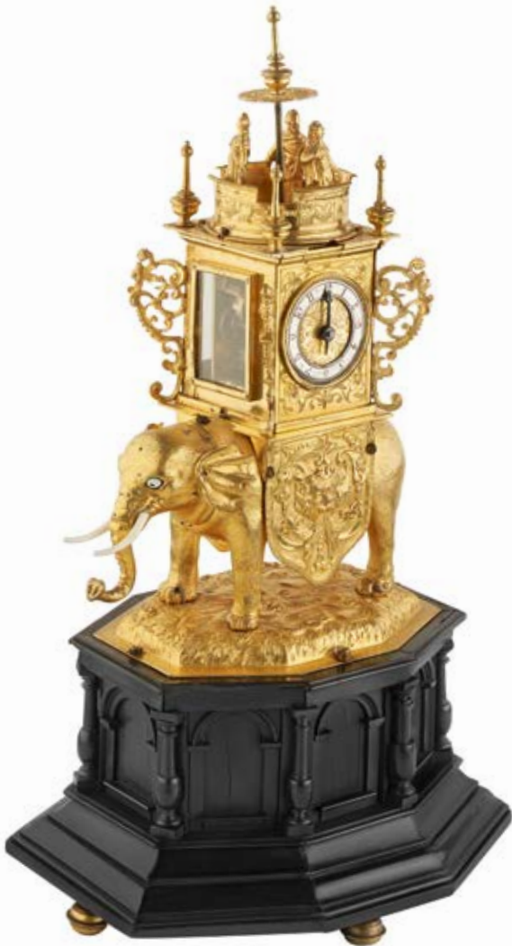
▲ AUTOMATON CLOCK IN THE FORM OF AN ELEPHANT, CA. 1600 Kunstsammlungen und Museen Augsburg

A “period face” greets visitors in every section: A Bajuvarii woman, Knight Templar, Anabaptist, merchant, and mirror coater introduce themselves in gallery-filling media installations. They tell about their lives and the way of the world – the village priest from Seehausen am Staffelsee ponders the French Revolution, the Anabaptist from Augsburg faith and persecution, the Jewish physician from Würzburg plague and medicine.