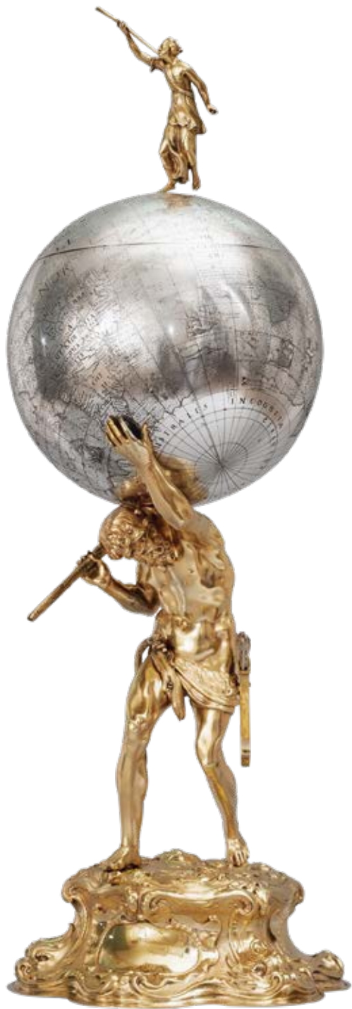
▲ GOBLET IN THE FORM OF A TERRESTRIAL GLOBE, 1618–30 The Royal Court, Sweden, Stockholm

THE BAVARIAN STATE EXHIBITION “ONE HUNDRED TREASURES FROM ONE THOUSAND YEARS” LOOKS BACK ON THE PERIOD FROM AROUND 600 TO 1800. ONE HUNDRED EXHIBITED OBJECTS FROM BAVARIA, GERMANY AND EUROPE ILLUMINATE OVER ONE THOUSAND YEARS OF BAVARIAN HISTORY AND HIGHLIGHT BYGONE ERAS.