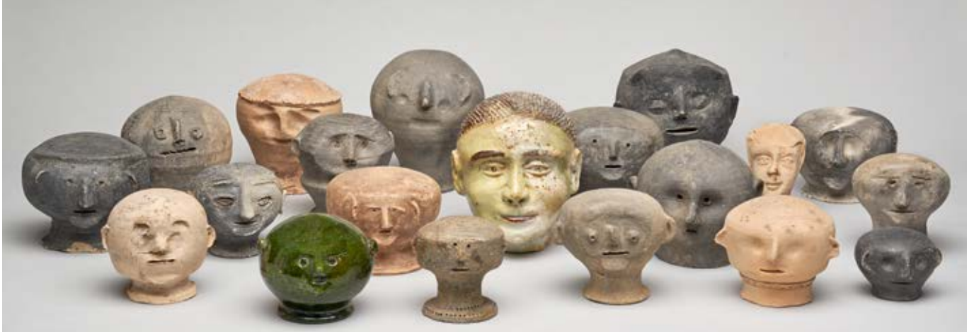
▲ EX-VOTO FIND FROM ST. THEOBALD IN GEISENHAUSEN, 17 TH /18 TH CENTURY

This is documented by a bog body's boots, a hidden hoard of gold coins from the Thirty Years' War or an ex-voto find consisting of enigmatic clay heads. A manuscript of the Lex Baiuvariorum furnishes insights into Bavarians' oldest tribal law. A metal lock pick was a piece of evidence against a burglar in the 16th century and leather dog armor attests aristocratic passion for the hunt over 300 years ago.