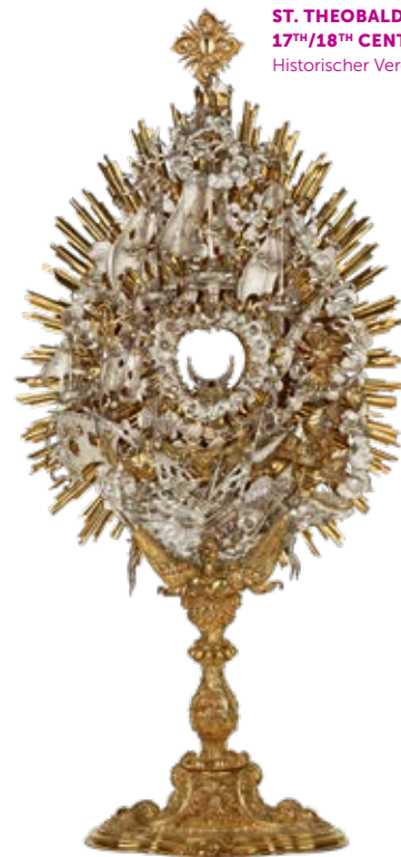
▲ LEPANTO MONSTRANCE, 1708 Bürgerkongregation Maria vom Sieg, Ingolstadt

Rare exhibited objects chronicle emperors and dukes, luxury and splendor and attest magnificent artistic achievements: the fibula from Wittislingen, the gem-encrusted Gospels from Niedertaich, the famous Lepanto monstrance, a whale's shoulder blade painted with a Venetian scene, an 18 th -century planetarium and much more.