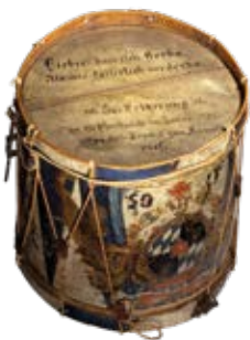
◀ THE GOTZING DRUM FROM SENDLING CHRISTMAS MASSACRE, CA. 1700 Heimatmuseum Miesbach

Media stations and touch-and-smell stations allow further exploration with all the senses at many places in the exhibition.