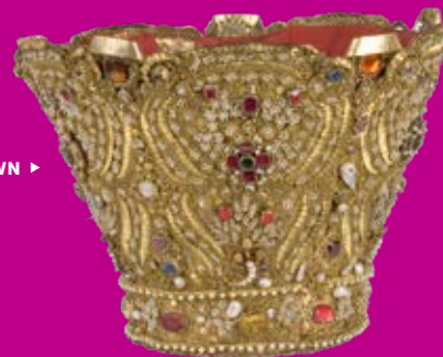
SO-CALLED BRIDAL CROWN ▶ OF DUCHESS HEDWIG OF BAVARIA-LANDSHUT, CA. 1720–25 Oberhausmuseum Passau

THEY RANGE FROM SHINY GOLD TREASURES AND SINGULAR WORKS OF ART TO EVERYDAY ITEMS THAT REVEAL A GREAT DEAL ABOUT THE REALITIES OF LIFE IN THOSE DAYS. THEY NOT ONLY TELL OF FAME AND GLORY BUT ALSO OF FATES AND DEFEAT, MYSTERIOUS GOINGS-ON, AND EVEN CRIMES.